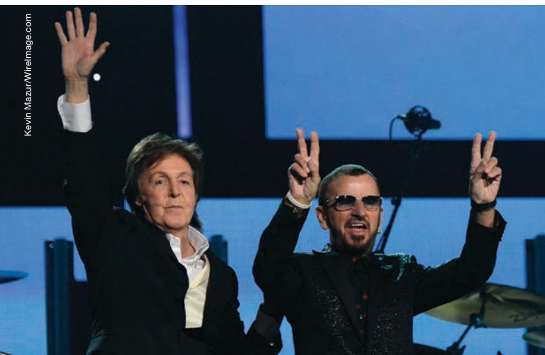
Paul McCartney and Ringo Starr at the 56th Annual GRAMMY Awards

You can learn more details about The Recording Academy's many programs at www.grammy.org .