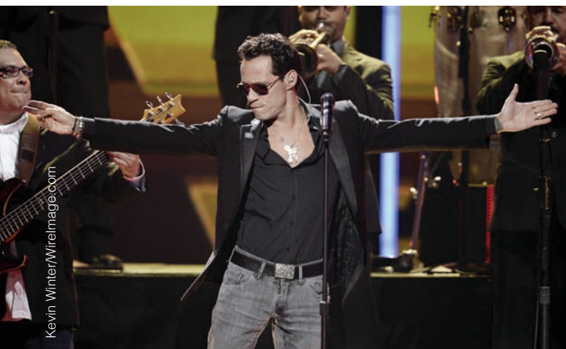
Marc Anthony performs at the 14th Annual Latin GRAMMY Awards in 2013. Anthony won Record Of The Year for “Vivir Mi Vida.” The night's big winner, with three awards, was Colombian singer/songwriter Carlos Vives

For more information, visit www.latingrammy.com , or contact The Latin Recording Academy's headquarters in Miami at 305.576.0036 or the Awards office in Santa Monica at 310.581.8689.