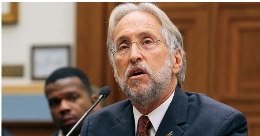
Neil Portnow testifies at the House Judiciary Committee’s Subcommittee on Courts, Intellectual Property and the Internet hearing “Music Licensing Under Title 17 Part One” on June 10, 2014

For more information about Advocacy & Industry Relations at The Recording Academy, visit www.grammy.org/advocacy . To learn more about the “Give Fans The Credit” campaign, visit www.givefansthecredit.com .