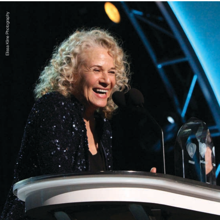
2014 MusiCares Person of the Year Carole King

To learn more about MusiCares' programs and services, visit www.musicares.org or call 310.392.3777.